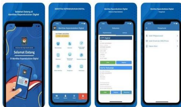
Source: Processed by the author via the IKD application, 2024.

For applying public services related to e-KTPs, it is critical to consider the perspective of the community as service recipients. Because communities are important stakeholders in this process, understanding their viewpoints can help provide a more complete picture of the success of their messages. Communication issues encountered in public services related to e-KTP in Malang City demonstrate that, while the notion of decentralization has been adopted, its execution still confronts hurdles. Decentralization gives local governments the power to manage and control public services in their areas. The development of e-KTP is one example of an important public service. To make it easier to organize population administration services, the government created a Digital Population Identity (IKD) program that allows users to access electronic information and view population papers that may be utilized for e-KTP.