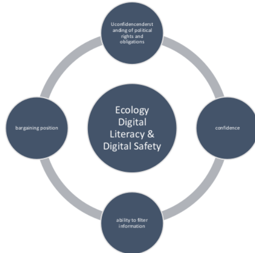
Figure 2. Ecology Digital Literacy and Digital Safety (Literature treat by researcher, 2022)

This election may be due to a particular understanding of citizenship, namely the obligation to stay informed – using election-related content on social media. While their intentions may be good, it is unlikely that first-time voters will 'like' or follow a broad spectrum of parties or candidates, leading to polarized exposure. However, flux in the digital media environment creates a somewhat situational engagement with political content compared to the more stable and usual exposure. So if there's an easy way to filter the bubble for young voters, there may also be an easy way out.