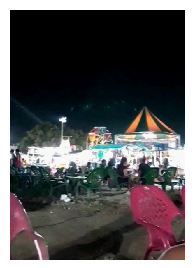
Gambar 5. The Cadger Situation on the Night in Ponorogo Regency Squre

The night activities that took place at the Ponorogo Regency square were buying and selling activities that the differences with day and morning that if at night there will be more Cadger who lined up offering their wares. Night activities will begin around after Asr or around 3pm. The cadgers will start holding snacks around the square. The area with the most street cadger is in the north. Many kinds of products sold are dominated by food sellers who are most purchased by residents. Various kinds of rice cakes are sold such as fried sticks, grilled sausages, fruit salad, roasted corn, sweet corn, juice, cheese cassava, boiled peanuts, and heavy foods like fried rice and chicken noodles. There are only those to be take a way, some open outlets to sit near the seller.