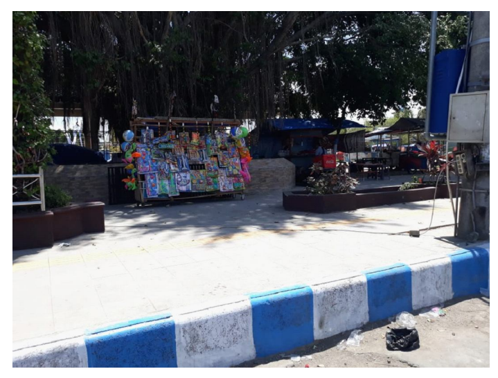
Figure 3. Cadger Conditions in Ponorogo Regency Square

The advantages of the Ponorogo Regency square are in the city center of Accessibility which is very easy to reach from various parts of Ponorogo and as a city icon. The place is very strategic; access that can be passed is a highway with easy and smooth pavement. There are four sides that can be accessed to the town square. From the west it can be accessed from Central Java, from the north is Madiun, from the East Trenggalek Regency while from the south it can be accessed by Pacitan Regency. There is a traffic sign that can lead to the town square.