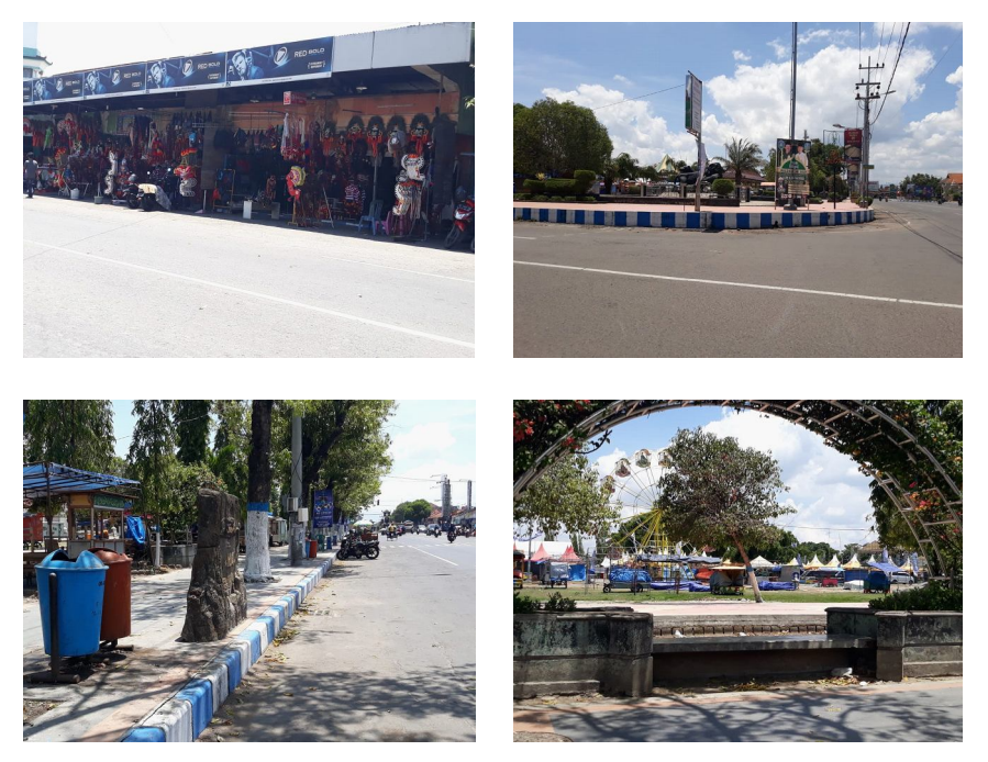
Fiigure 2. The Condition Arround the Ponorogo Regency Square

In the Ponorogo Regency square, there are several facilities that support community activities. There is a large pedestrian area that can facilitate pedestrians, both in the afternoon and at night. The road around the square is the main road which wide enough for vihicled. In addition there are also several shades such as vegetation or pergola around it. This pergola is accompanied by a seat to relax. Trash facilities are available for cleanliness around it.