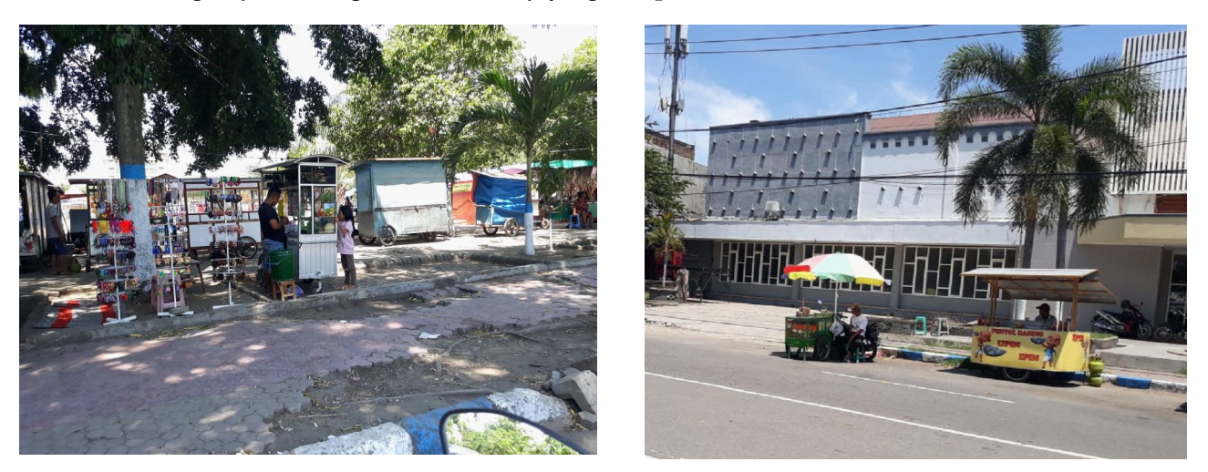
Figure 4. the interaction of sellers and buyers in Ponorogo Regency Square in the afternoon

Activities held in Ponorogo Regency square occur from morning to midnight. At one time the activity on this square will run for 24 hours. Daily activities such as general activities will take place every day continuously. The square will never be quiet because there are always visitors coming. The activities carried out vary greatly. Activities that are normally carried out are interaction activities, such as chatting or just sitting back while enjoying a cup of coffee.