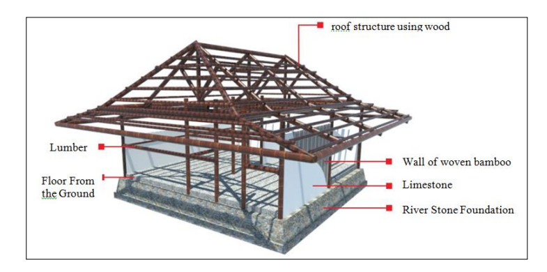
Figure 1. Fala kanci house construction

As is known that the main ingredients forming cement are lime (CaO), silica (SiO), alumina (Al2O3) and a little magnesia (MgO), and sometimes added with alkali (Kurniawan et al., 2016).