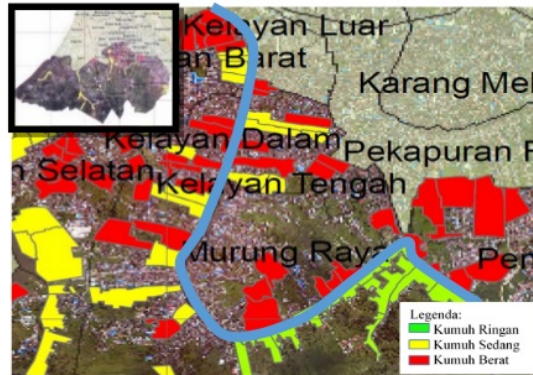
Figure 1. Slum area location map of Kelayan's Riverside

The research is conducted in the city of Banjarmasin, South Kalimantan Province. In the Statistics of Banjarmasin year 2016, Kelayan's river has the length of 3.227 meters and 26 meters width. Kelayan's river geographically is located in the southern of Banjarmasin city. Kelayan Barat, Kelayan Luar, Kelayan Tengah, Kelayan Dalam and Murung Raya are the districts that passed by and used the Kelayan's river as the administrative boundaries. In the following map is the administration Kelayan's riverside and the deployment of slum area map: