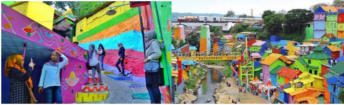
Figure 3. (Left) Photo spots around Kampung Warna-Warni Jodipan. (Right) Kampung Warna-Warni Jodipan.