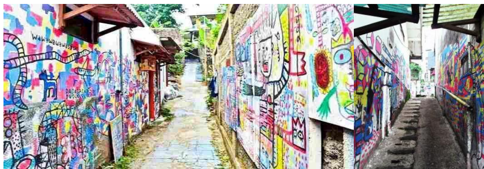
Figure 2. Murals in Kampung Dago Pojok Alleys.