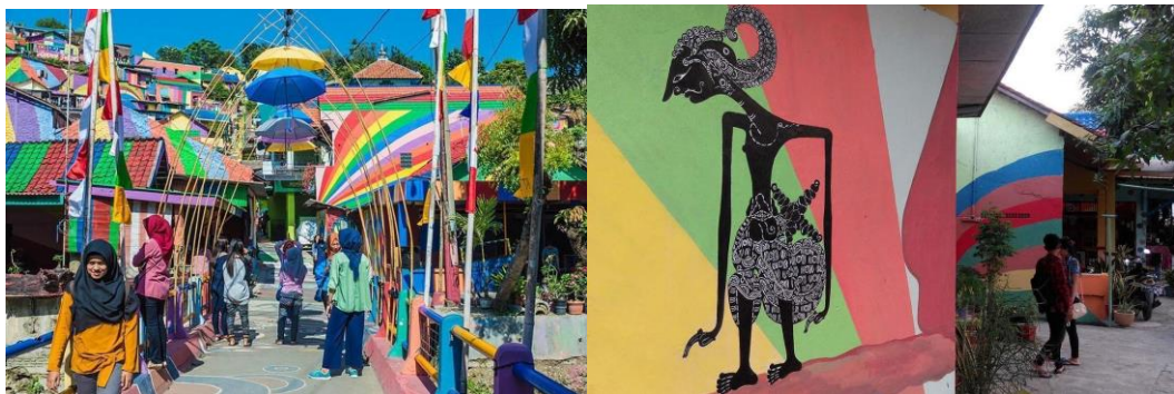
Figure 4. (Left) Bridge in Kampung Pelangi. (Right) Mural in Kampung Pelangi.

The second village is Kampung Warna-Warni. Kampung Warna-Warni is an urban village altered into a tourist village, located in Gang 1, Jodipan Village, Blimbing District, Malang City, East Java. This village used to be a slum before several students from the Communication Department of the University of Muhammadiyah Malang (UMM) took the initiative to turn this village into an attractive one. This village is painted in vivid colors and entices tourists to visit it as it becomes one of Malang's tourist attractions. This program has successfully eliminated the residents' bad habits since the village is now converted to a prime tourist location. The presence of visitors proves beneficial for the community as it motivates them to prioritize comfort towards the flocking tourists (Wulandari, 2017). The tourists' enthusiasm prompted them to increase the village's visual appeal, as shown from several photo spots, picturesque walls, umbrella aisles, and other facilities such as food stalls, public toilets, parking lot, etc. (Nur et al., 2019). On-site observations showed that visitors are interested in coming to Kampung Warna-Warni Jodipan because they have seen many photos of this village uploaded on Instagram (Rizki & Pangestuti, 2017).