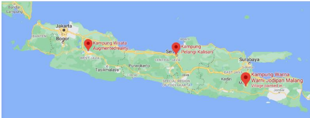
Figure 1. The Location of the Three Villages on Java Island, Indonesia