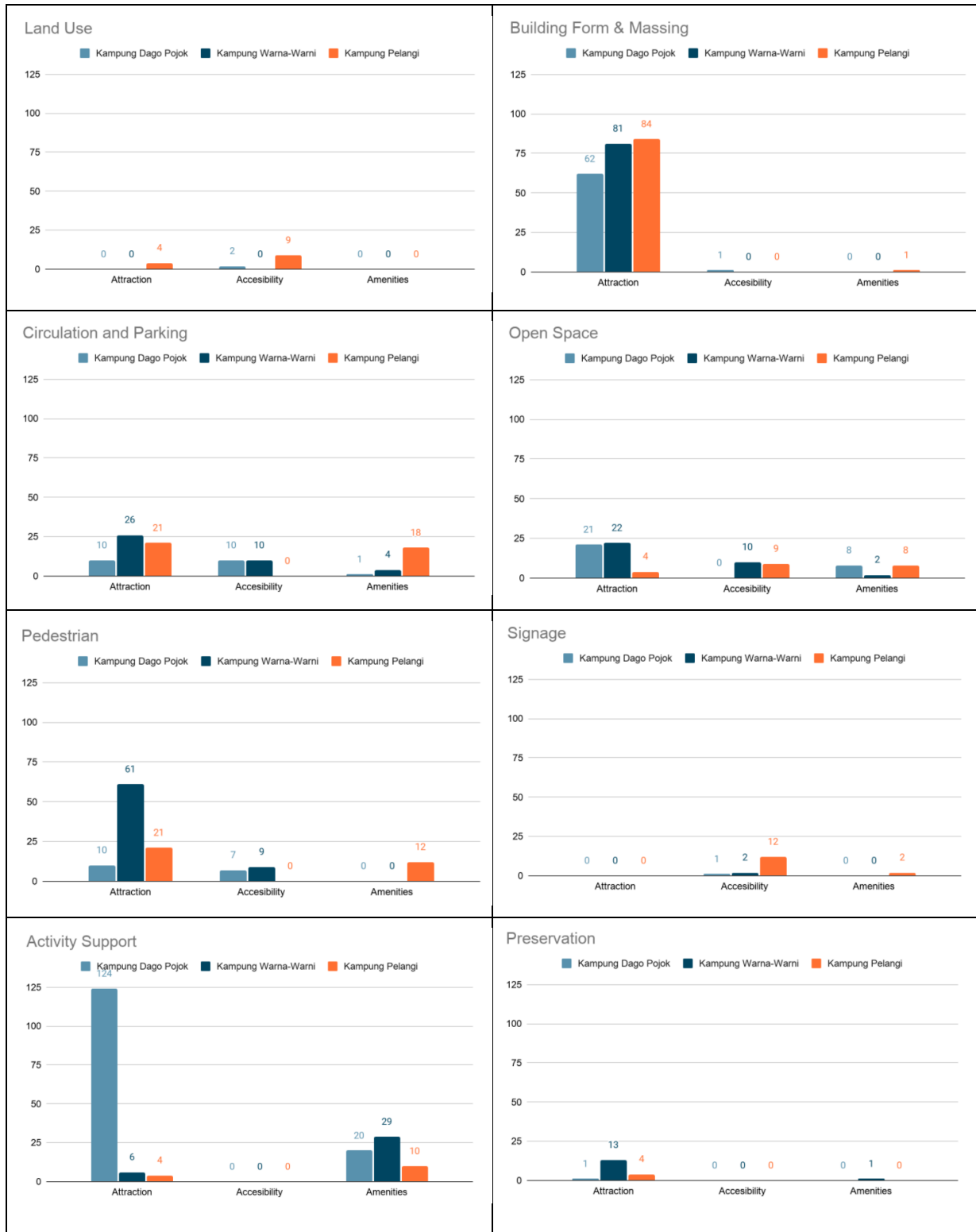
Diagram 3. Analysis of Coverage of Tourist Villages' Urban Design Elements

Based on previous data, it was discovered that attraction is the paramount aspect of a tourism village reported by online media. However, a further assessment determined from urban design theory revealed two different patterns from this aspect alone. For