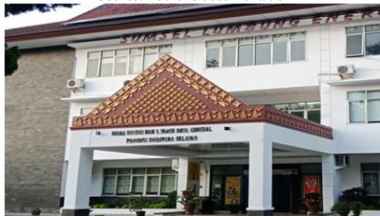
Figure 6. Tanjak ornaments at the Department of Energy and Mineral Resources of Sumatra Selatan 6