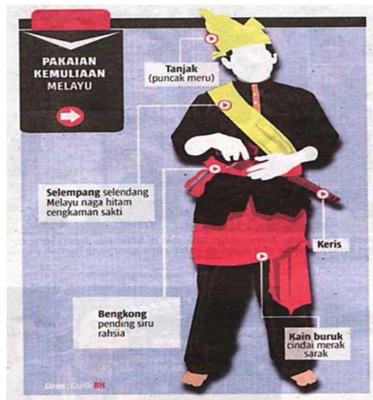
Figure 1. The use of Malay traditional clothes and tanjak 1

Malay traditional clothing is a manifestation of the Malay culture itself, where the shape, structure, function, ornamentation, and manufacturing method have certainly existed from past time and passed down from one generation to the next, serving as a form of preserving the culture. One of the main components of Malay culture is Malay traditional clothing. This traditional Malay dress was formed and explicitly designed by the Malay community by prioritizing creativity and aesthetics as well as the meaning contained therein (Handoko, 2017). Likewise, it is true with tanjak itself, which was created as a manifestation of the high value of dress in the Malay tradition.