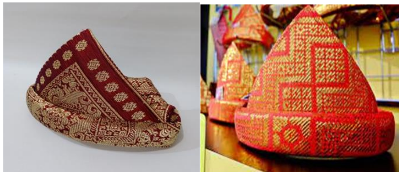
Figure 4. Songket Tanjak 4