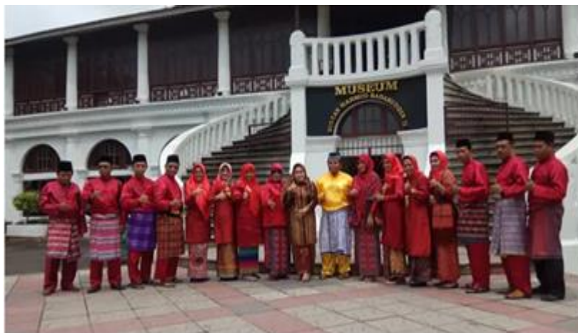
Figure 11. PNSof Palembang's Department of Culture and tourism wearing traditional Palembang clothes