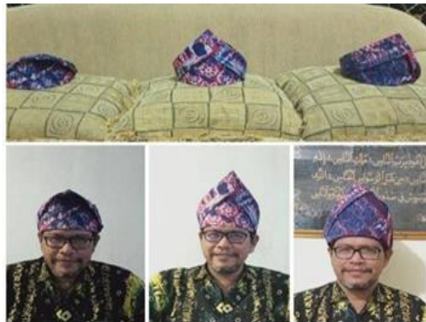
Figure 2. Types of tanjak in Palembang 2

The types of Palembang tanjak consist of tanjakkepundang , tanjakmeler , tanjakbelanumbang , and ikat-ikat ketangbekarem . There are many types of tanjak , the only difference being the type of material used. Along with the development along many eras, there have been many types of tanjak circulating in the people of Sumatra Selatan. According to Mr. Ali Hanafiah, this is not a problem as long as the philosophy of tanjak remains in strongly held.