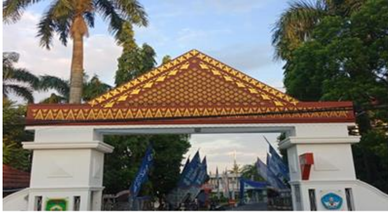
Figure 7. Tanjak ornaments at SMA Negeri 1 Palembang 7