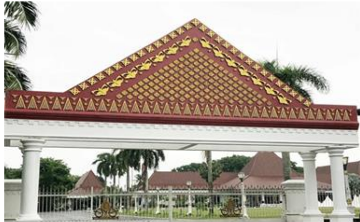
Figure 5. Tanjak ornaments at Griya Agung 5

After the Sumatra Selatan provincial government ratified this governor regulation, several offices and tourist attractions started to build their tanjak ornaments. So far, from the observations of this study, several offices and tourist attractions that have used tanjak as office ornaments are as follows: