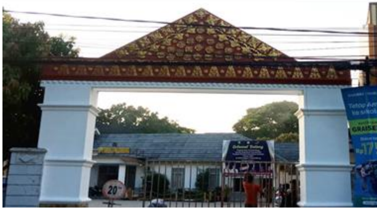
Figure 8. Tanjak ornaments at SMK Negeri 3 Palembang 8