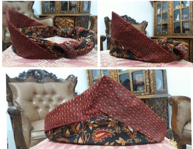
Figure 3. The typical tanjak of Palembang 3