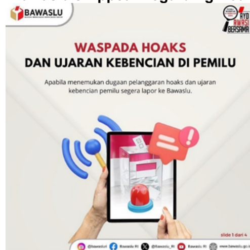
Figure 2. Content of Bawaslu's Appeal Regarding Hoaxes and Hate Speech