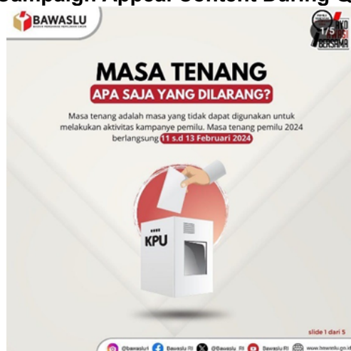
Figure 3. Campaign Appeal Content During Quiet Period

At the national level, Bawaslu is actively posting content on social media that urges the public to be aware of hoaxes, for example, what was done in a post dated February 20, 2024. Where that date is the sixth day after the 2024 Election. The content contains information about how the public should respond to hoaxes and hate speech, an invitation to report the incident to Bawaslu, and Bawaslu's efforts in Guarding Digital Space. Guarding Digital Space itself is Bawaslu's effort by spreading election messages peacefully through social media and collaborating with anti-hoax communities; together with election participants, peaceful coalitions, and social media platforms, making a peaceful declaration for the 2024 Election; synergizing with the Ministry of Communication and Information and social media platforms to eradicate hoaxes and all forms of misinformation about the election spread on social media; assisting law enforcement officers in enforcing the law against the behavior of spreading election hoaxes; and through the election hoax reporting hotline, cyber supervision is strengthened regarding the handling of public complaints about election hoaxes.